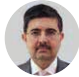
Uday Kotak President-Designate CII and Managing Director & CEO Kotak Mahindra Bank Limited