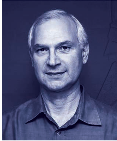
Jamshyd N Godrej

Chairperson, CII Foundation and Chairman & Managing Director Godrej & Boyce Manufacturing Company Limited