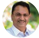
Vikram Kirloskar President, CII and Chairman and MD Kirloskar Systems Ltd and Vice Chairman Toyota Kirloskar Motor