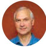
Jamshyd N Godrej Past President, CII (1993-94) and Chairman & Managing Director Godrej & Boyce Manufacturing Company Limited